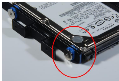
Each screwed point of VPAB-2500 is attached with anti-shock rubbers