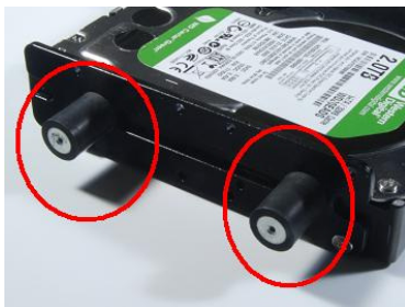
Each screwed point of VPAB-3500 is attached with anti-shock rubbers